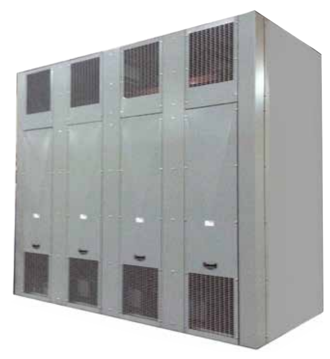
Figure 1. 7500/10000 kVA Transformer