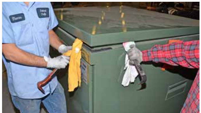
Figure 4. Using pry bars to "break loose" the roof gasket attachment. Protective measures, such as wrapping the pry-bars with cloth as shown should be used to protect enclosure finish( paint).

ii. To avoid damage to the roof and enclosure, it is best to wrap the pry bars with cloth or to use cardboard or other padding to minimize potential damage to the paint finish