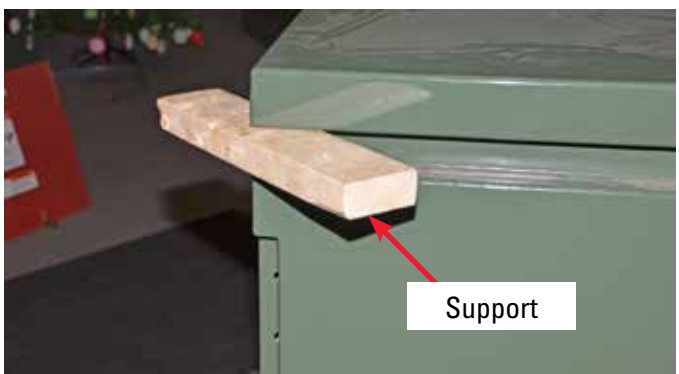
Figure 5. Wood block support installed at corner, initial location.

ii. To avoid damage to the roof and enclosure, it is best to wrap the pry bars with cloth or to use cardboard or other padding to minimize potential damage to the paint finish