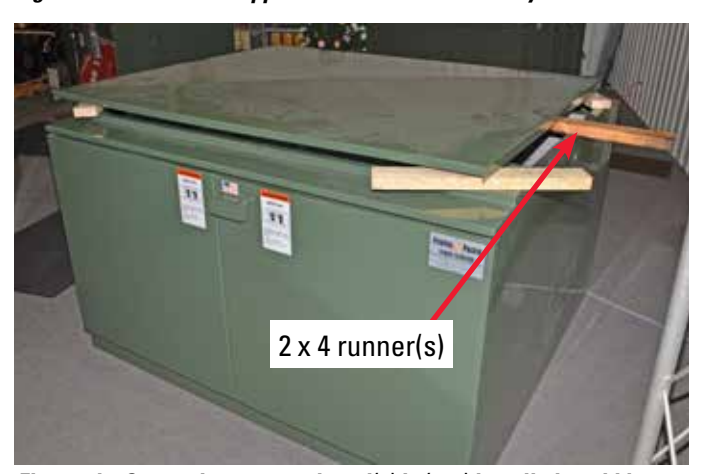
Figure 6b. Cross-piece runner board(s) is (are) installed to aid in removal of the roof and are normally installed in the direction the roof will be moved.