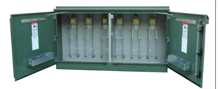
Figure 1. Dead-front Pad-mounted PSE-9 Switchgear Unit, with doors open and secured with wind-braces.

1. Open the doors on both sides of the switchgear, using the wind-braces to secure the doors in the open position. (Figure 1)