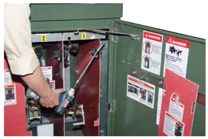
Figure 2. Preparing to remove roof retaining hardware. Note 9/16" socket on extension bar with wobble attachment and power driver. (Live-front design shown for illustration purposes only.)

Remove and retain the nuts, clamping plates, and associated hardware used to secure the welded stud-bolts on the underside of the roof to the switchgear enclosure. (See Figure 3)