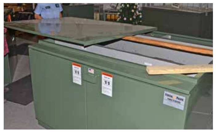
Figure 7. PSE roof moved to side to allow work on switchgear.