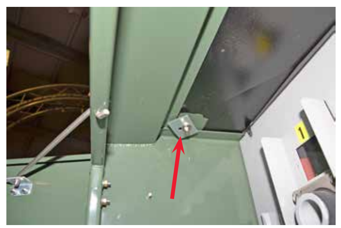
Figure 3. PSE clamping bracket in corner of termination compartment.